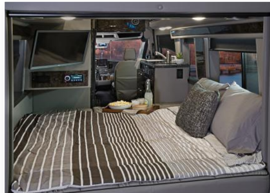
Power lounge in sleeping position

Luxury appointments and amenities abound in the Passage from Midwest Automotive Designs. Unmatched elegance and style, complimented by superior craftsmanship, fit and finish, make this luxury coach truly one of a kind.