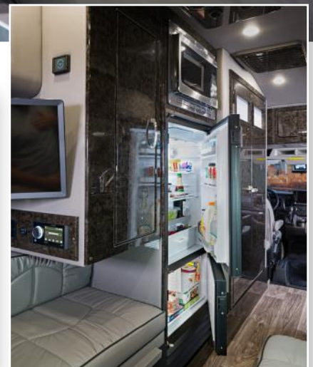
Large 7.3 cu. ft. refrigerator freezer combo.