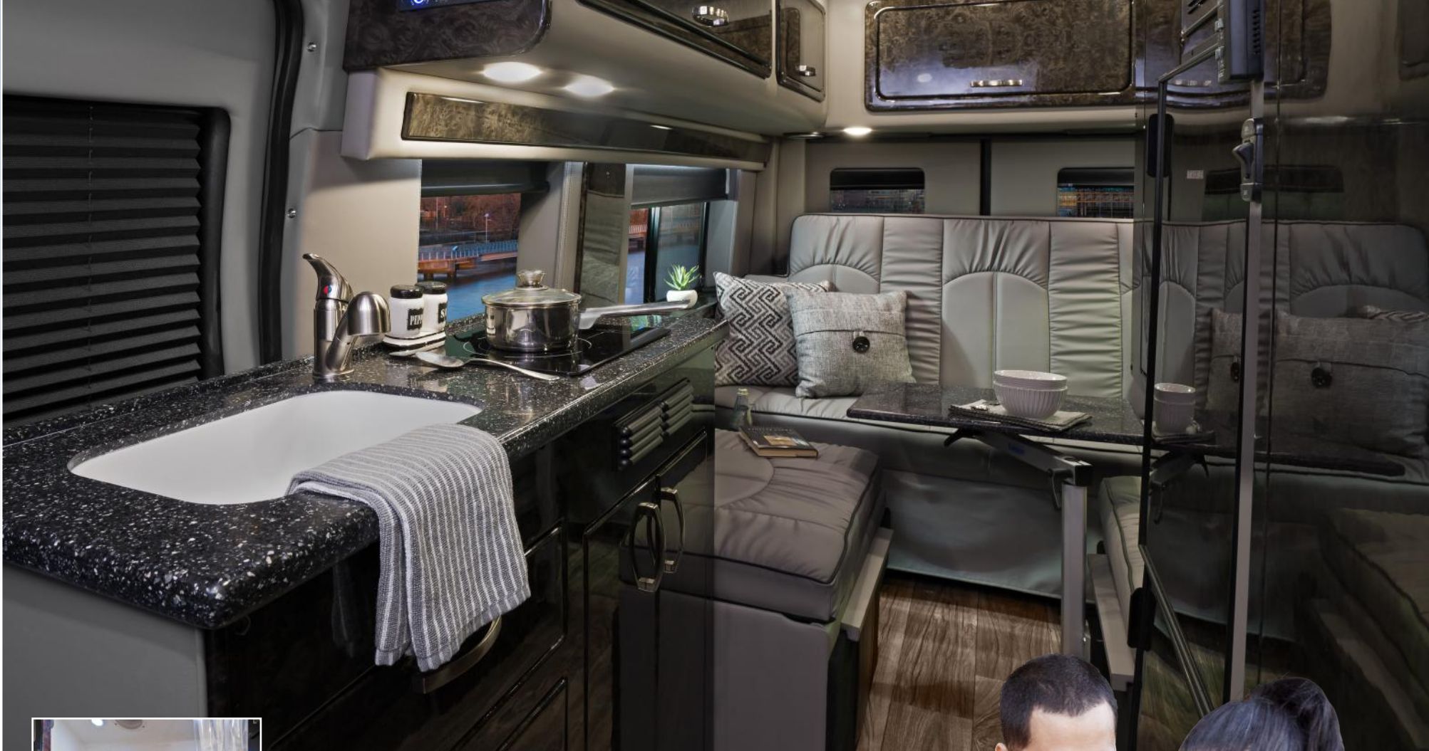
Solid surface counter, induction cook top, hi gloss black burl cabinets.