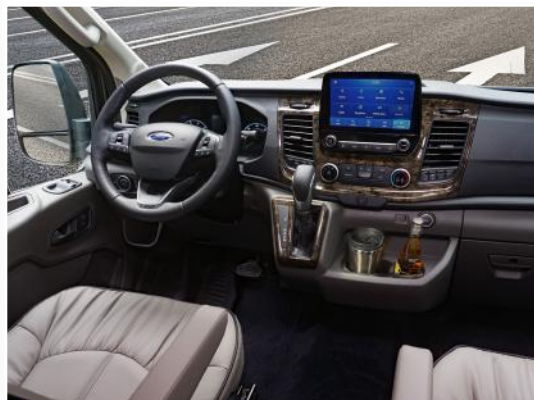
Ford upgraded dash with satin finished dash and door accents.

Exceptional design and state-of-the-art amenities bring your ideas for fun and functionality to life in high style.