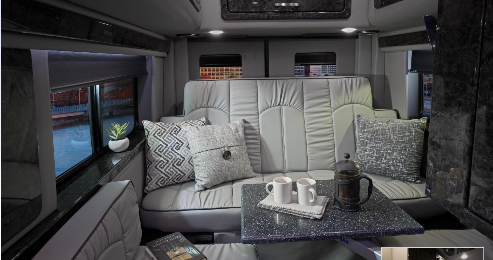
MD2 power lounge sofa, with Maybach style graphite seating and black burl cabinets.