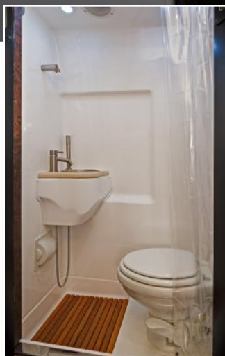
Two-piece fiberglass shower with porcelain toilet, solid surface sink